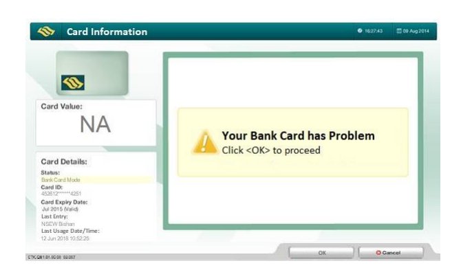
Cards with NETS FlashPay functionality – Not good for Transit

You will encounter the following messages if your card is not good for transit (as shown in the pictures below).