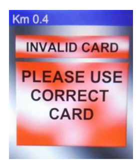
Card readers on buses