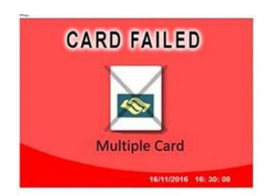
Fare gates at MRT stations

You will see the following messages (as shown in the pictures below) when multiple contactless cards (e.g. Mastercard, Visa or NETS FlashPay cards) are detected at the fare gates or card readers, and you will not be able to enter/exit the station/bus. Please take out the card you intend to use from your wallet or bag so that you tap only one contactless card at the fare device to enter and exit, and always tap in and out with the same card.