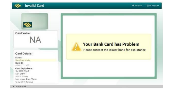
Cards without NETS FlashPay functionality – Not good for Transit