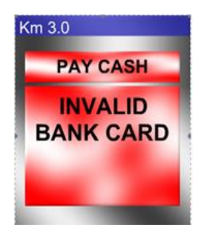
Card readers on buses

For debit or pre-paid card users, you will have to add additional funds into your bank account/card.